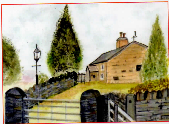
Mid-Longacres Farm (and the first lamppost) by Lyn Brady

gate, go down the curved driveway of Mid-Longacres Farm (spot the lamppost), then through the next gate onto a lane.