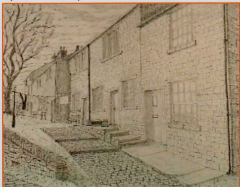
Prickshaw by Peter Williams Worth a look?

Soon you're at Prickshaw. The track passes in front of the fine conversions facing east to Tonacliffe and Brown Wardle – see what else you can pick out – to a junction. It's well worth popping round the leftward bend for a look at the row of smaller cottages and the little village green.* Note also the old gas lamp-posts – and the moorland behind the village lifting your eyes to the sky.