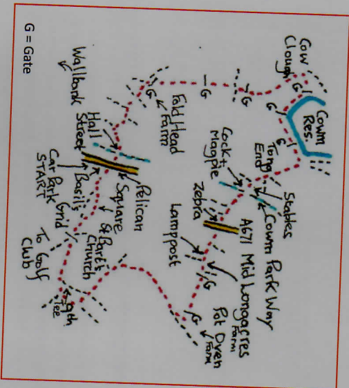
Map by Steve Flood

Yorkshire - the M62 bridge beyond Hollingworth Lake, and the White House at the top of Blackstone Edge on the A58 from Rochdale to Halifax. Now go left again at the signpost pointing you back through a second gap in the tramway, and aiming you at a field-wall about 200 metres dead ahead. This whole Lobden area has a history as Whitworth's playground. These days it's golf and horse-riding and mountain biking, but go back in time and rougher sports prevailed, notably running races and naked wrestling – a group of men from Oldham were once banned from participating after they greased up, making themselves impossible to grapple or pin down. The Great Pedestrian 'Treadle' Sanderson trained - and won his earliest races - up here. Two of Whitworth's fell races use this terrain – the Junior race each June (round the east of Brown Wardle and back over the top); and the senior out-and-back Hades Hill race in September which starts near the Square and crosses Brown Wardle and Middle Hill as well as Hades.