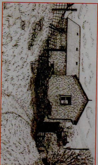
Fold Head Old Chapel. Pen and ink drawing by Peter Williams

Our route here turns left, up the steep and usually damp slope of Cowclough Rake, with the wood on the right and a decent, recent drystone wall on the left. In fact the driest ascent is usually on the narrow embankment next to the wall. (It has the added advantage of a view.) If you walk on the stones of the Rake, do take care – the wheel-grooved flagstones can be very smooth and slippery, so it may be better to be a horse and walk up the angled, bedded stones between them. At the top bear left, then right, through a gate and along a gloopy, track. Over the gate you'll have a good view of Pot Owen nesting beneath Brown Wardle, but you're going straight on (another useful left embankment) over a stile; and then straight on again. There isn't really much to say about this path, it being hemmed in by embankments and walls, other than that it's quite the dullest footpath in Whitworth...but it doesn't last long.